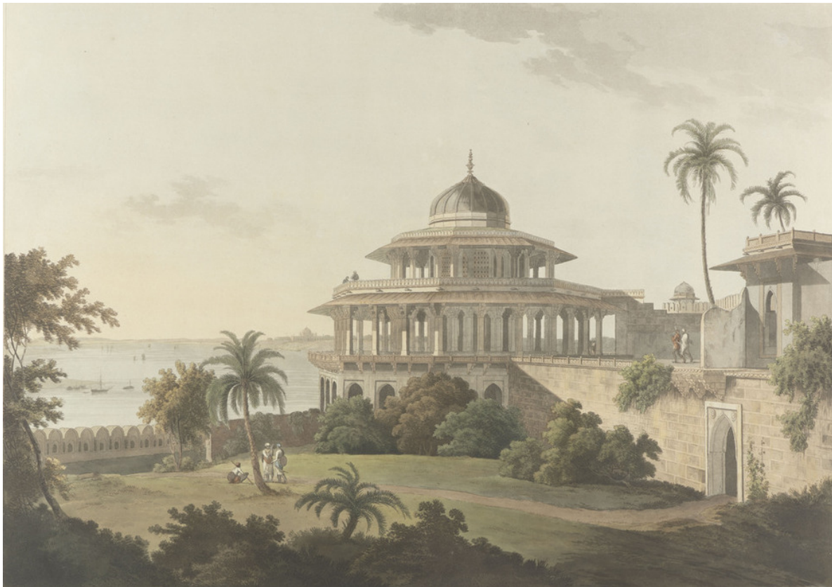
The Chales Satoon in the Fort of Allahabad on the River Jumna, 1795–1807, aquatint, by Thomas (1749–1840) and William Daniell (1769–1837). On view at the San Francisco International Airport/ International Terminal [A2].

Asia Week San Francisco Bay Area has announced the program schedule for the second annual edition of the West Coast's first, major region wide event celebrating Asian art - taking place September 30 - October 8, 2016. Thirty-three participants and partners comprised of private and non-profit venues including galleries, museums, arts organizations, universities and auction houses throughout the Bay Area will offer a week of public programming.