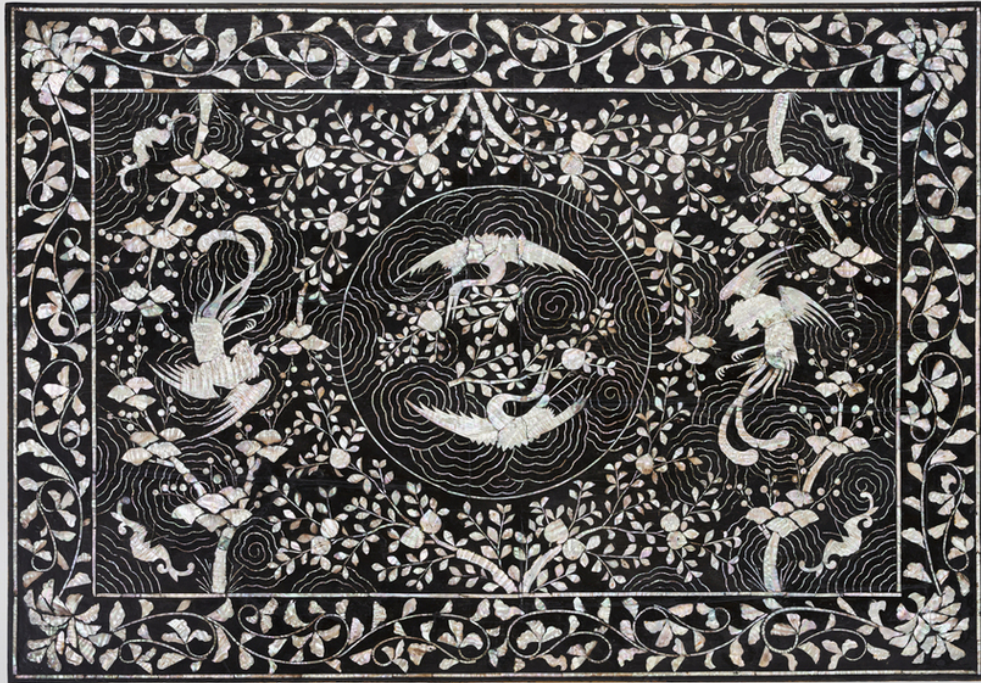
Table with phoenix, crane, and peach motif, 1800–1900. Korea, Joseon dynasty (1392–1910) Lacquered wood with inlaid mother-of-pearl by Unknown. On view in "Mother-of-Pearl Lacquerware from Korea" at the Asian Art Museum. (Asian Art Museum, Museum purchase, 2016.39.)

🏠 architecture (/tag/architecture) 🏺 asian antiques (/tag/asian_antiques) 🎨 asian art (/tag/asian_art) 🎭 contemporary art (/tag/contemporary_art)